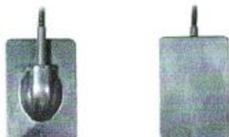
Top and bottom views of the Sensor Capsule* * with rear exit cable