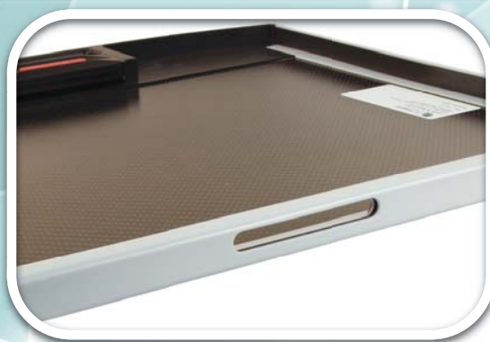
Custom Utility Ports