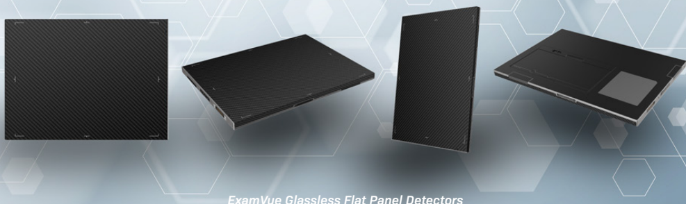
ExamVue Glassless Flat Panel Detectors