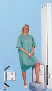
Shown with optional hospital-grade wall stand